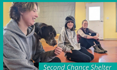
Second Chance Shelter