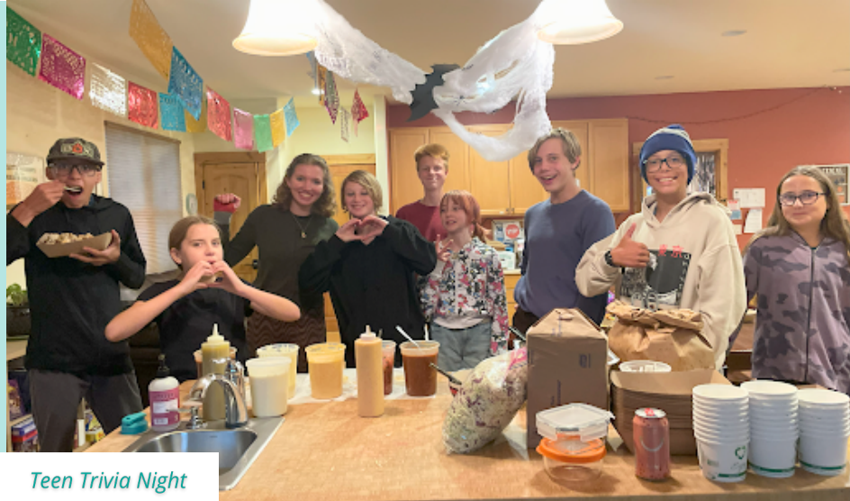
Teen Trivia Night

As a rural area and small town, opportunities and experiences can often feel isolating. Our goals for the Teen and Community programs are to provide support in creating safe and enjoyable spaces for youth in Ouray County —helping them to build confidence and broaden their horizons.