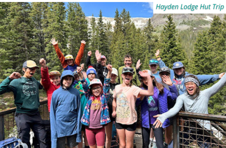
Hayden Lodge Hut Trip

Our approach to identify and address the interconnected risk factors and protective factors within a community allows for a more comprehensive strategy to prevent negative behaviors like substance abuse, violence, and school failure among youth by focusing on multiple areas of influence such as family, school, and peers. This long term systems change work is in its final phase as we implement, evaluate, and determine sustainable ways to continue to support our youth at the community level.