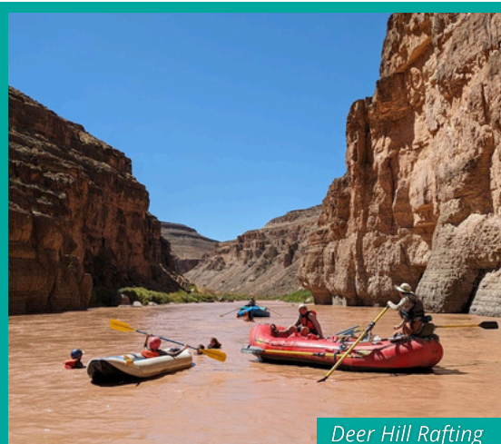
Deer Hill Rafting